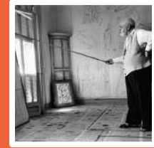
Design with Lines Diseño con líneas