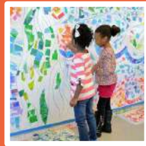
Collaborative Mural Making Creación de murales colaborativa