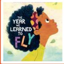
The Year We Learned to Fly El año que aprendimos a volar